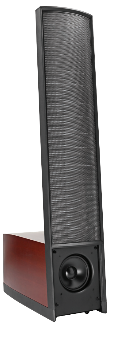
The forward firing 8in (20cm) aluminium cone bass unit, its clip-on cover removed.

Impression's towering height. The XStat is held by a strong alloy frame.