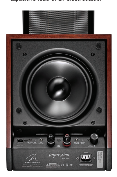
Rear 8in aluminium cone woofer, WBT input terminals and rotary bass level control at right – plus much else.

Driving an electrostatic for me has always meant using a good valve amplifier. Electrostatics are both a difficult load and desperately revealing of all that feeds them: I used our Icon Audio Stereo 30SE single-ended valve amplifier as always, with Chord cables. Solid-state amps can handle them but it's best to listen first, since they can behave quite differently when faced with the heavy capacitive load of an electrostatic.