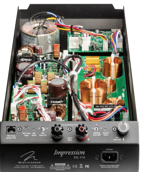
Big crossover section at right, twin Class D power amps, Digital section and linear power supply all sit in the base tray.

Right off the Impression 11As were as sparklingly clean, clear and massive in their presentation as 1 expected (knowing Martin Logans